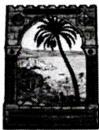
אנימה ספירא אסף זרמון וישראל

עכשיו במחיר שנתי מקוון בעלות של $950 בלבד